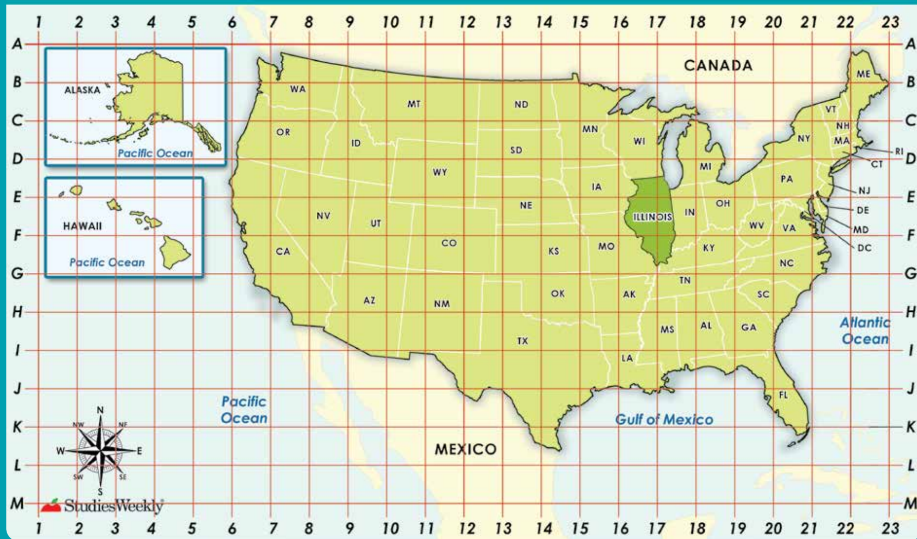
MAP OF UNITED STATES OF AMERICA

The absolute location of a place is its exact location. We describe where something is using absolute location when we use a coordinate grid . Look again at North America. Our state, Illinois, is located at F17.