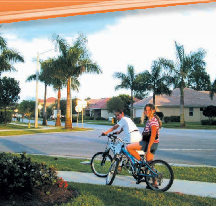
People need a place to live.