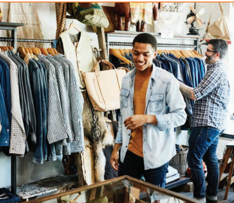
People need clothes to wear.