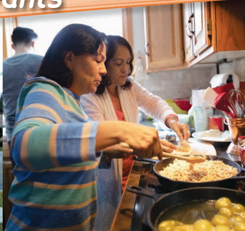
People need food to eat.