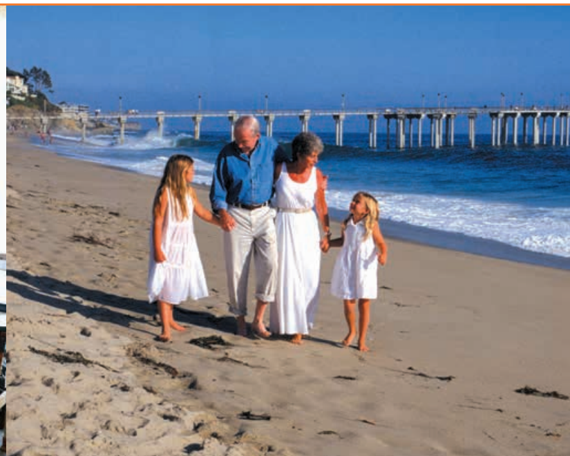
People need each other.