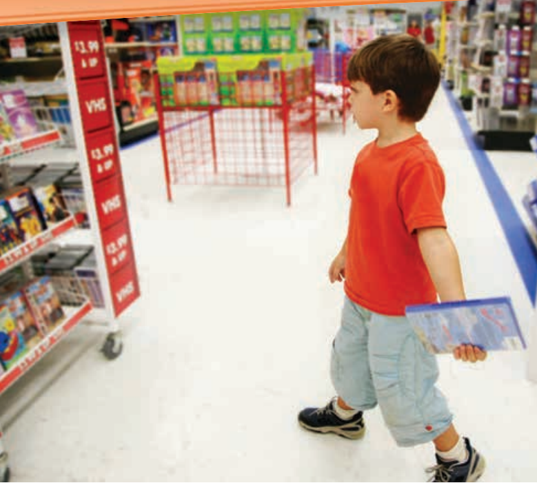
People want many things they do not need. Can you think of some things you want but do not need?