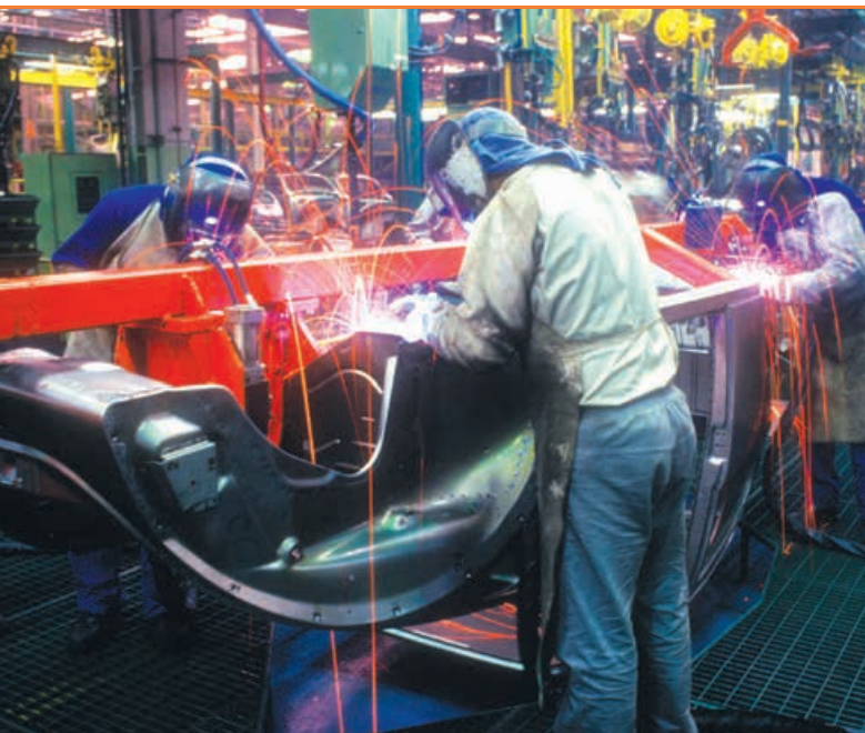
People work to earn money.