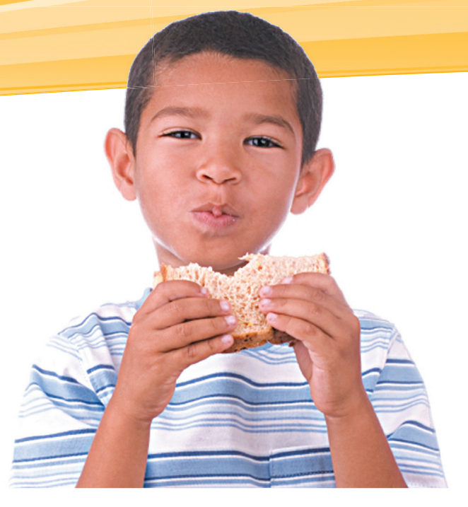
People use energy for many things. Energy from food helps us work and play.

Energy can change things. A push or pull can move something. Heat from the sun can melt snow. Light can make a dark room bright.