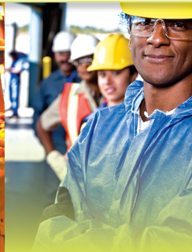
On Labor Day, we honor America's workers. Labor Day is the first Monday in September.