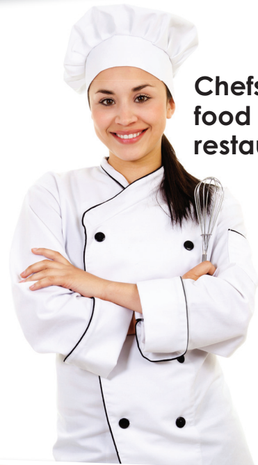
Chefs cook food in restaurants.