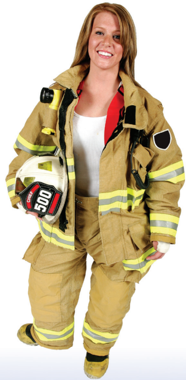
Firefighters help keep people safe.