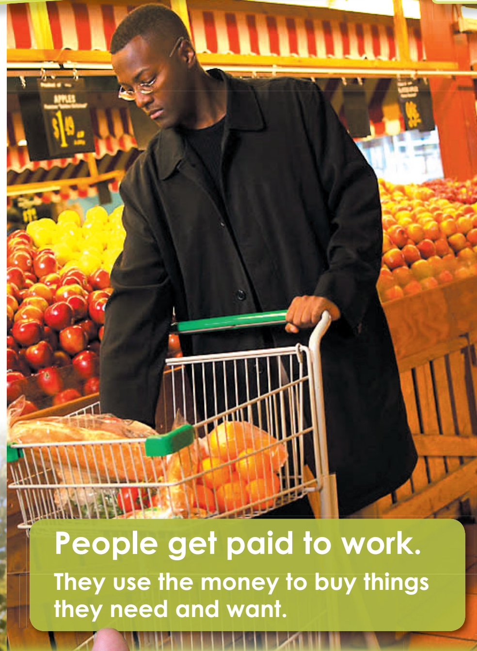
People get paid to work. They use the money to buy things they need and want.