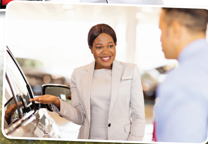
Salespeople help you buy things.